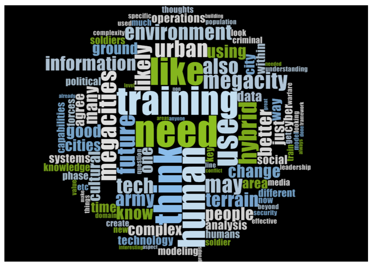
Figure 11: 100 most frequent terms from the Megacities and Dense Urban Areas Conference chat room and Twitter discussions.

The Megacities and Dense Urban Areas Conference also included over 500 individuals participating virtually through web streaming, a chat room, and Twitter: #madsci16. Chat room and Twitter discussions were captured and an initial analysis of this data was conducted using a qualitative data analysis tool to identify the 100 most frequent terms used by participants for insight into predominant discussion topics. Based on this analysis, as visualized in the word cloud below, "training", "human", "hybrid", "change", "cultural", "tech", and "terrain" are among some of the more frequently used terms (See Appendix 4 for separate word clouds for the chat room and Twitter discussions)