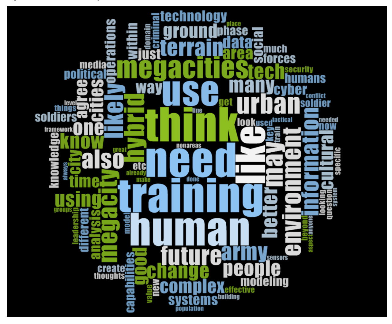
Figure 18: 100 Most Frequent terms from chat room discussion.