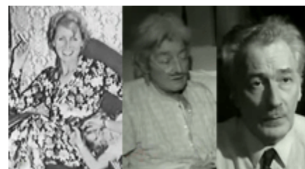
Left: X1's mother in the late 1970s. Mid and right: X1's parents in 1998, claiming complete ignorance on everything their daughter is talking about. They stated otherwise during interrogations.