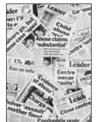
Back issues of the Leader covering the case.