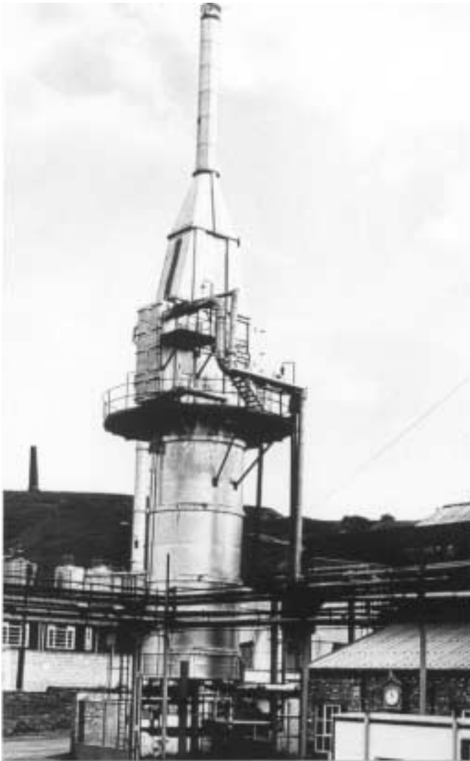
Figure 4: 1973 The continuously wound upshot Beverley heater

This proved to be very efficient but much too fast for the rest of the system and resulted in many problems due to thermal cracking of the cast iron columns, until a slow warm-up technique was developed. One part of the improved system was that all the pumps were to be driven by electricity and not steam. Therefore an Emergency Generator was required. It proved to be very effective when we had power cuts during the 'winter of discontent'! The pitch circulation pumps were also fitted with creosote flushed glands. The other BSC Tar works thought we were mad. There were times when we thought so too!