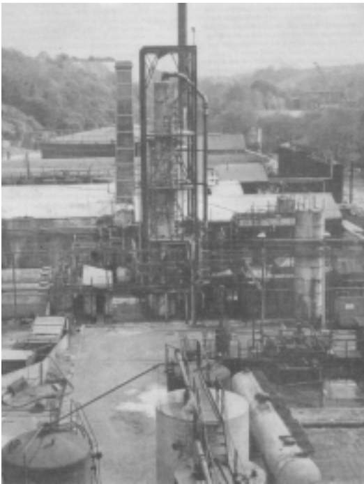
Figure 2: 1954 The modified Lennard continuous pipe still

The Wilton Tar Still was erected at Crew's Hole in 1951, again based on a continuous pipe furnace, it was the main distillation unit until 1973, when British Steel Corporation, Chemicals Division, replaced the furnace with a continuously wound upshot Beverley heater.