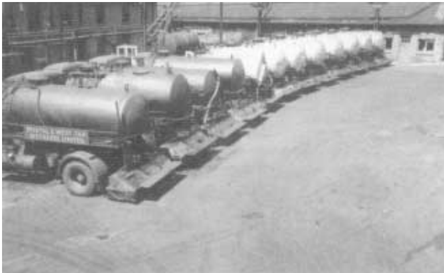
Figure 7: 1954 Tar Spraybars on parade!

On the other hand, the naphthalene content of coke oven tar was much higher than that of gasworks tar. Naphthalene production increased but it was never so profitable as tar acids. Bristol works had a virtual monopoly in sublimed naphthalene, until, following the Flixborough disaster, a hazard survey closed the plant.