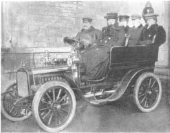
Figure 6: The first registered motorcar in Bristol. AE 1 in 1904