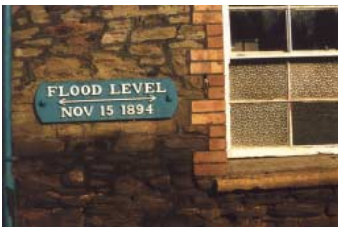
Figure 8: The 1894 Flood level marker