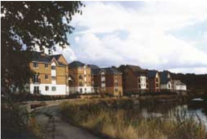
Figure 9: 1996 Quayside Village. Exclusive riverside houses

Sadly, the Butler's tar works has gone and has been replaced by the Quayside Village.