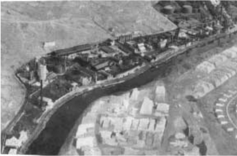
Figure 1: 1954 Crew's Hole Tar Works from the air

When the Conham Chemical Works closed in 1904 and Stone and Timson's in 1924, both sites were incorporated into the Butler Works.